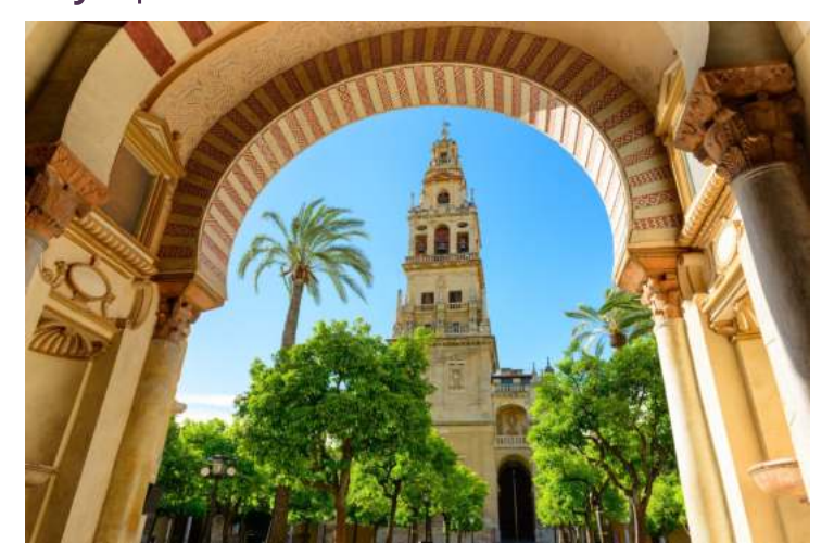
Day 4 | Onwards to Córdoba and Seville

Tread in the footsteps of Spain's last emirs, joining your Local Specialist for a visit to the incredible Alhambra, with its amazing palaces, gardens and fountains. Inspired by poetry, the architecture is said to be a reflection of paradise as described in Islamic verse. Immerse yourself in the tranguil atmosphere in quiet courtyards, follow its colossal ancient walls and admire the ornate stone carvings. We then leave Granada behind for Córdoba where we'll join a Local Specialist to visit the mesmerising Mosque of the Caliphs, a jewel of Hispano-Islamic art featuring striking arches and Byzantine mosaics. Our final stop for the day is alluring Seville, our home for the next three nights.